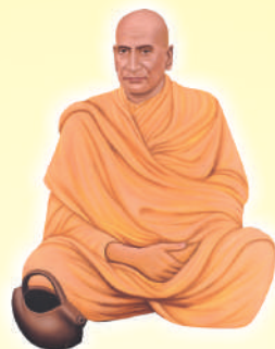
स्वामी श्रद्धानन्द जी Swami Shraddhanand Ji (1856-1926)

“गुरुकुल की स्थापना का उद्देश्य भारतीय संस्कृति का उन्नयन तो है ही साथ ही छात्रों को अनुशासित वातावरण में सर्वांगीण विकास और रोजगार परक शिक्षा देना भी है।”