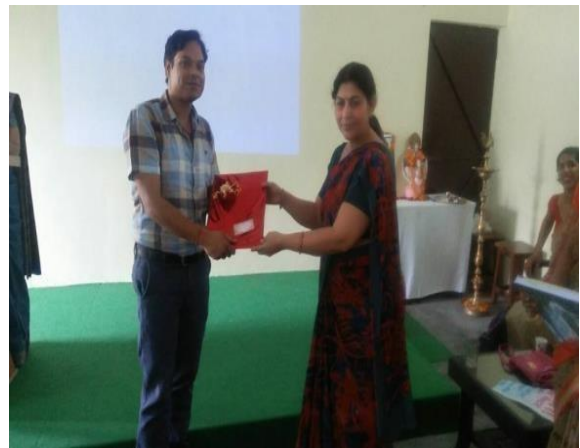
03 Days FDP session at MMPGC College, Haridwar (2018)