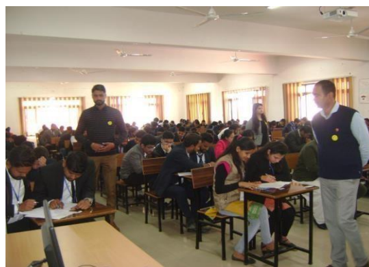
Pics of 7 th Fiesta Quiz Competition, 23 rd Feb 2,2019