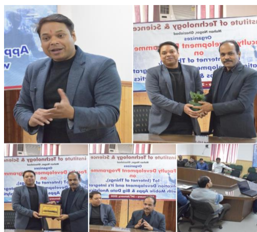
Conducted FDP on RM, ITS Ghaziabad, 2020