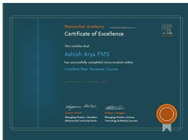
Certified Peer Reviewer Certificate,2022