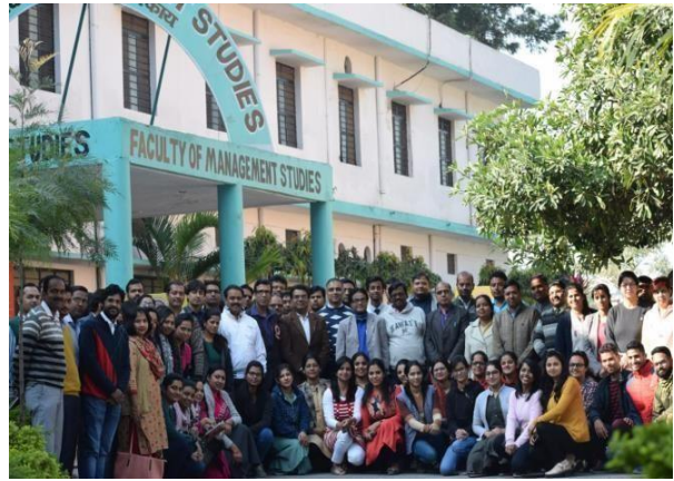
Workshop on Statistical Analysis using R and R studio, Nov.2018