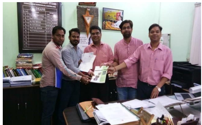
Consultancy Project for RSEGS and Anchor,2018