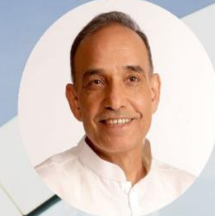
Dr. Satya Pal Singh Chancellor